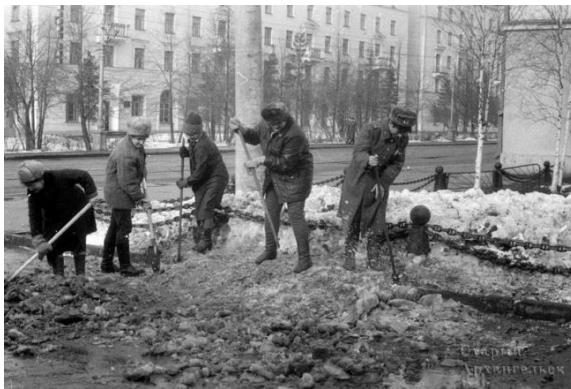
Figure 3: Public participation in greening during subbotniks: 1938 (left) and 2014 (right)

of city residents known as “subbotnik” (taking place on Saturdays) and “voskresnik” (on Sundays) appeared in order to improve or clean up green spaces (Fig. 3). People were involved in such “social cohesion practices”, while at times involuntarily since their sense of agency was rather limited. Such measures aimed to contribute to the ecological and sanitary improvement of the affected green spaces and surrounding residential areas while, at the same time, promoted collectivism as the main purpose of public life within the major leitmotif of state socialism (Ignatieva et al. 2015).