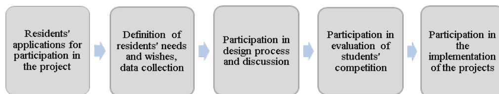
Participatory process in Courtyard Movement project in Riga