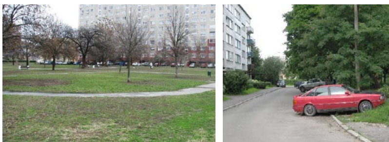
Figure 1: Underused green areas of the case studies (left: Budapest, right: Riga)