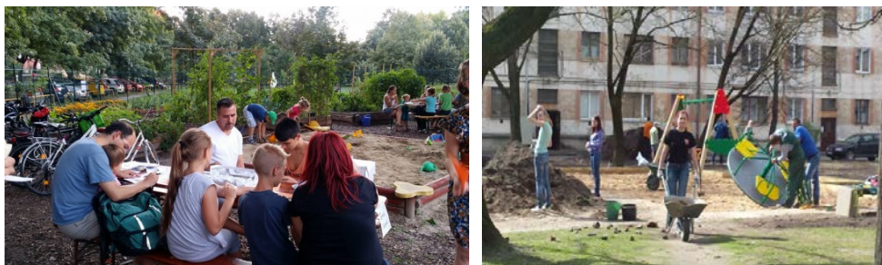
Figure 2: Motivated neighbourhood communities (left: Budapest; right: Riga)

In Latvia, one of the activities that have contributed to residents’ participation in the regeneration of the residential environment is the so-called Courtyard Refurbishment Movement. This project aims to encourage people to engage in the improvement of the areas surrounding their housing. The Courtyard Movement was created within the framework of the “Big Clean-up” – a project whose aim was to help people discover their common points of view and to learn how to cooperate. Priority was given to applications that would encourage active participation of local residents during and after the project development of the courtyard landscaping. A wide range of stakeholders was involved in the various activities throughout the process: local residents, students from different fields, professionals as mentors, representatives of local government and sponsors.