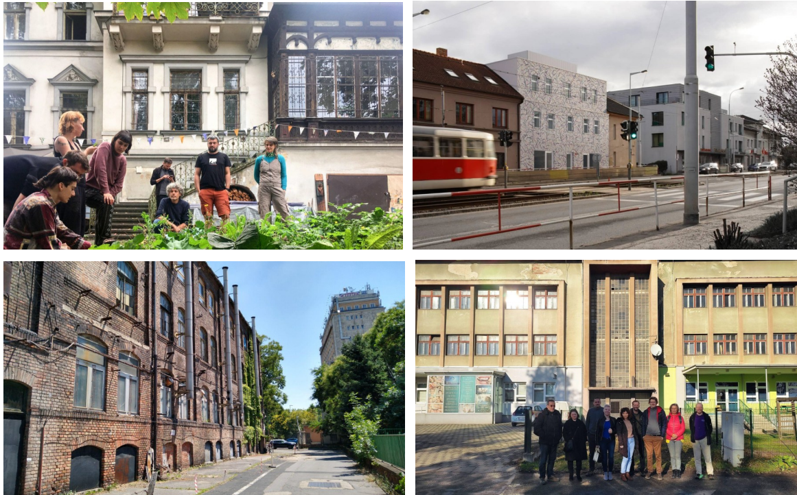
Figure 1: MOBA pilot projects

Note: Vzletý racek, Děčín (top-left), První vlaštovka, Prague (top-right), Ganz 82, Budapest (bottom-left), Křiževci housing project (bottom-right).