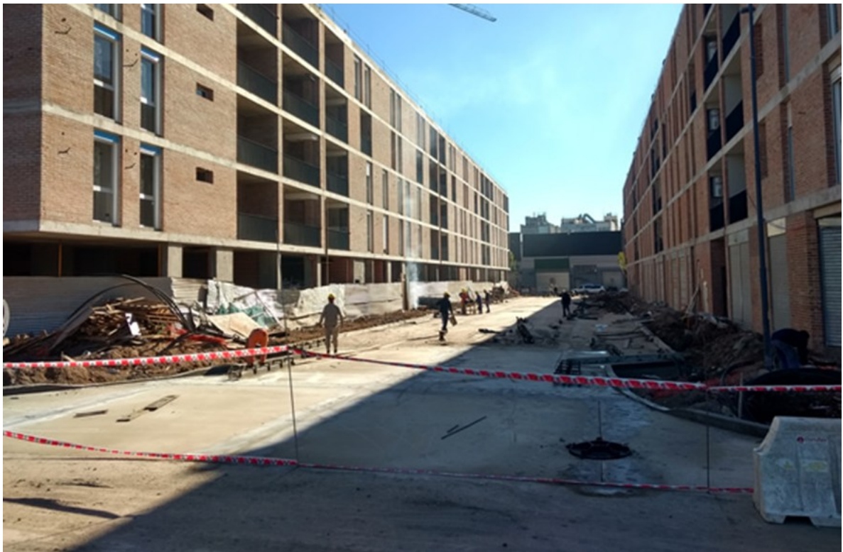
Figure 4: New dwellings in the Barrio Playón de Chacarita